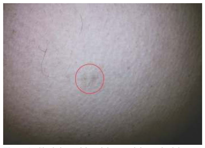
Figure 1 : Single brownish nodule over abdomen in right midclavicular line (encircled)

A 40-year-old male presented to our hospital with a painful nodular lesion over the abdomen since three months. Patient complained of excruciating pain over the lesion on manipulation and physical activity and even on respiration. There was no history of preceding trauma. Cutaneous examination of the affected area revealed a single brownish nodule of about 1.5 \times 1 cm in size on the abdomen approximately in right midclavicular line [Figure 1].