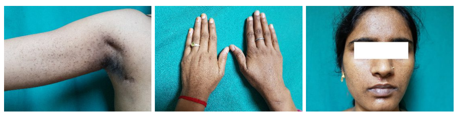
Figure 1: Reticulate pigmentation over axilla.

Histopathological examination showed circumscribed foci of epidermal proliferation and hyper pigmentation. The epidermis showed subtle proliferation in the form of delicate elongated and confluent rete ridges that showed antler like branching at places. The pigment was seen to be concentrated at the bottoms of rete ridges and also in the melanophages in papillary dermis (Figure no.5). Based on the clinical findings and histopathological