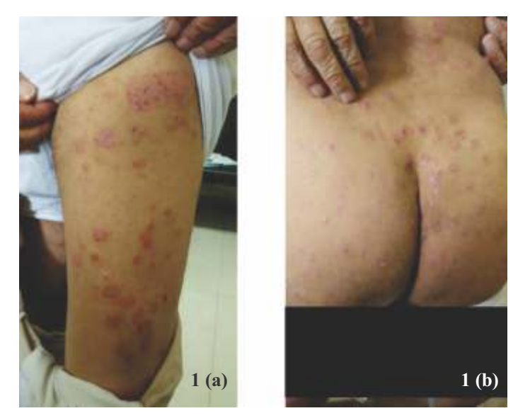
Figure 1: Itchy eczematous lesions over lower limb, buttocks and back in patient undergone total hip replacement (6 months post surgery)

due to polyetheretherketone following spinal surgery.