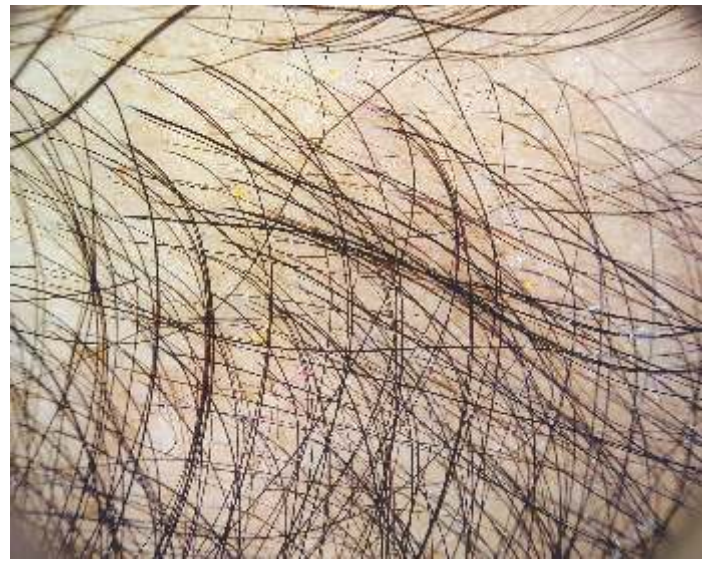
Figure 1: Dermoscopy of FPHL Ludwig grade III showing hair diversity more than 20 %. (DermLite DL4; 3Gen; polarized mode, 10x)

Scientists) SPSS Version 20.0, IBM, USA. Chi square test was applied to compare categorical data. Independent sample t test was used to analyse continuous variables between two groups. Mann Whitney test was applied to compare means of nonparametric data. A 'p' value of \leq 0.05 was considered significant.