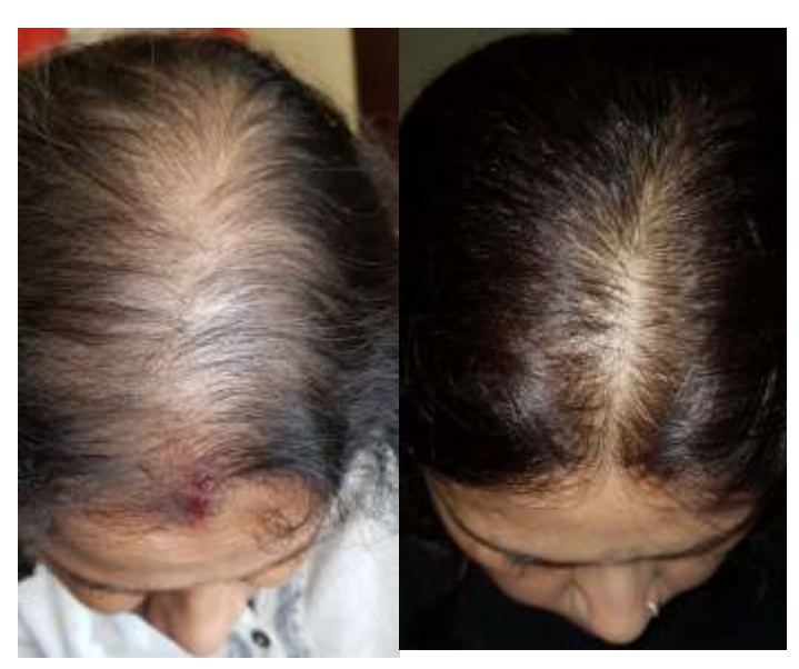
Figure 4: FPHL Ludwig grade III.