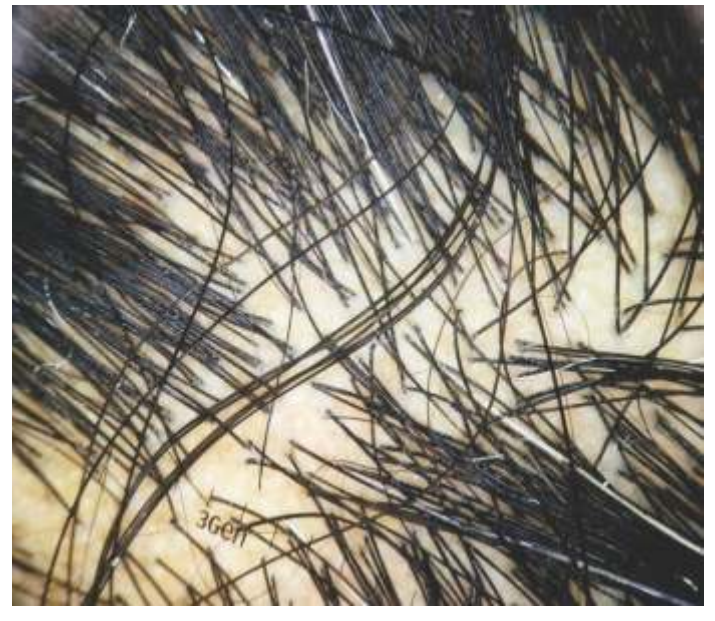
Figure 2: Empty hair follicles and short regrowing hair in CTE. (DermLite DL4; 3Gen; polarized mode, 10x)