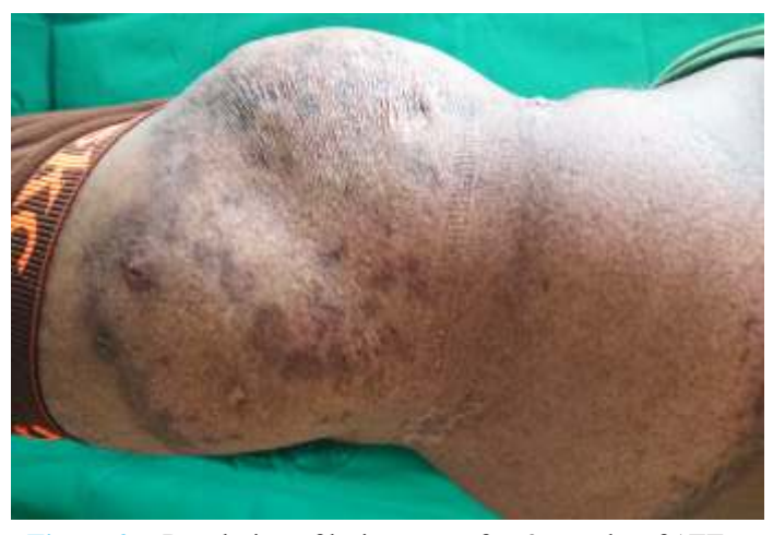
Figure 3: Resolution of lesion seen after 3 months of ATT

hematogenous or lymphatic spread, or by direct contiguous spread of the infection from an underlying focus like lymph node, bone or joint, or exogenously by direct inoculation of the bacilli onto the skin. In European countries, majority of lesions have been reported on the head and neck areas, whereas in India, cutaneous TB more commonly affect buttocks,thighs and legs, which may be due to inoculation while walking barefooted or sitting on soil without clothes.<sup>[3]</sup>